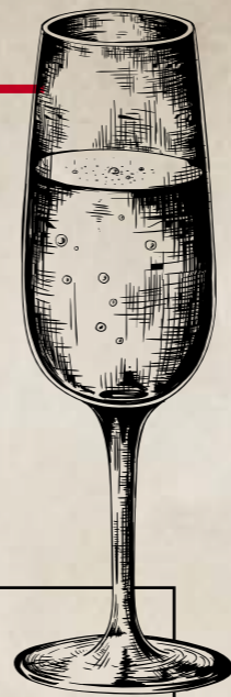
All our spirits are 25ml measures.